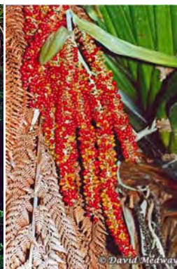
Ripe Collospermum hastatum fruits. Brooklands May 2002