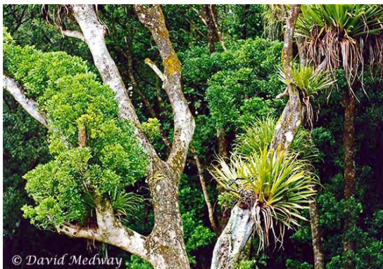
© David Medway Collospermum hastatum on Pukatea ( Laurelia novae-zelandiae )

Pukekura Park Collospermum hastatum photos: click on a photo to view a larger image, use Back button to return