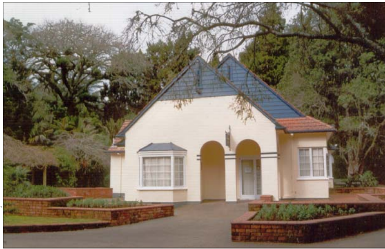
The Tea House in August 2005, before refurbishment

signed off the Resource Consent! The Tea House is a registered building with New Zealand Historic Places Trust, but not protected to the extent that work can not be undertaken. Permission is however required to alter external features- and with the entry change and new canopies over the Kiosk servery and back doors, we were doing just that. Any concerns the Trust had were waived after an early site visit when they saw first hand the poor condition the building was in and the efforts being undertaken to extend its workable life.