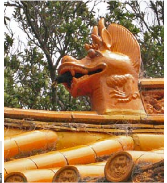
Right: Starling emerging from head of dragon on Chinese pagoda Below: Chinese pagoda at Kunming Garden

Because Starlings often nest in holes in buildings and in nest-boxes, it is not at all surprising that this pair should nest in one of the hollow dragon heads on the pagoda at Kunming Garden. Nevertheless, this would appear to be the first record of Starlings using such a novel site for that purpose!