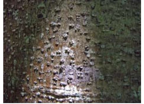
#3 Liriodendron chinense Fuller Walk