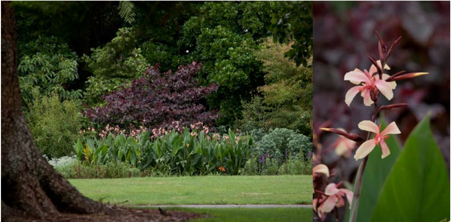
Canna lily 'Panache' set against Cercis canadensis 'Forest Pansy' in the Brooklands herbaceous border.