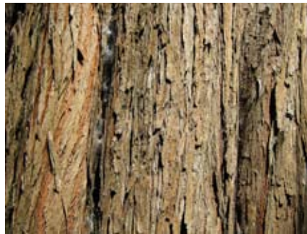
#5 Calocedrus decurrens Flagpole Hill