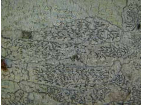
#1 Fagus sylvatica Upjohn Street