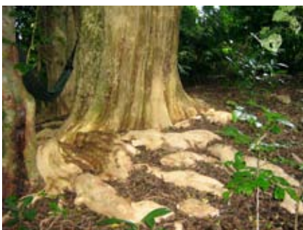
#10 Vitex lucens Somerset Street