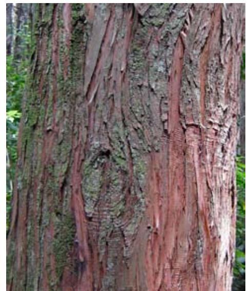
#7 Podocarpus totara Kauri Grove