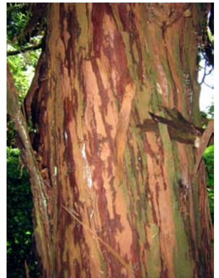
#6 Libocedrus plumosa Kindergarten Gully