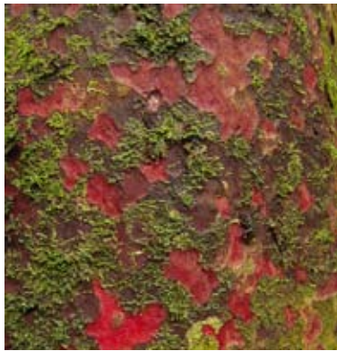
#8 Prumnopitys taxifolia Kauri Grove