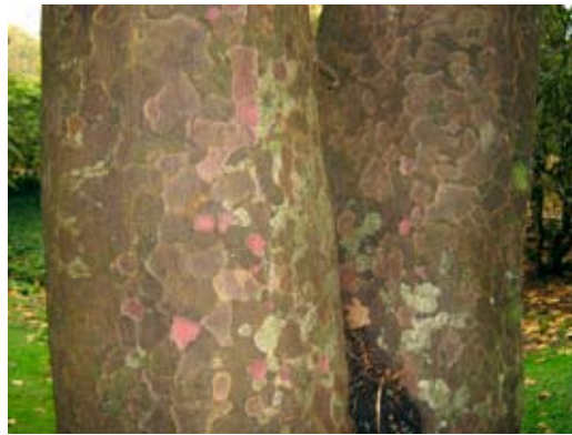
#9 Prumnopitys taxifolia Rhododendron Dell