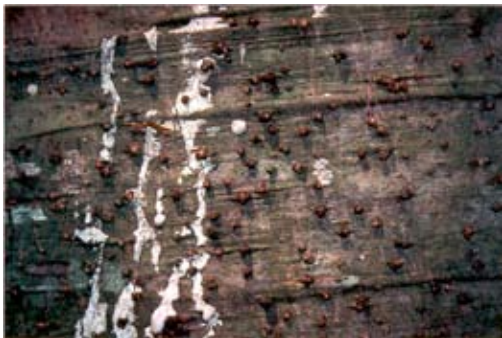
#4 Agathis australis Flagpole Hill