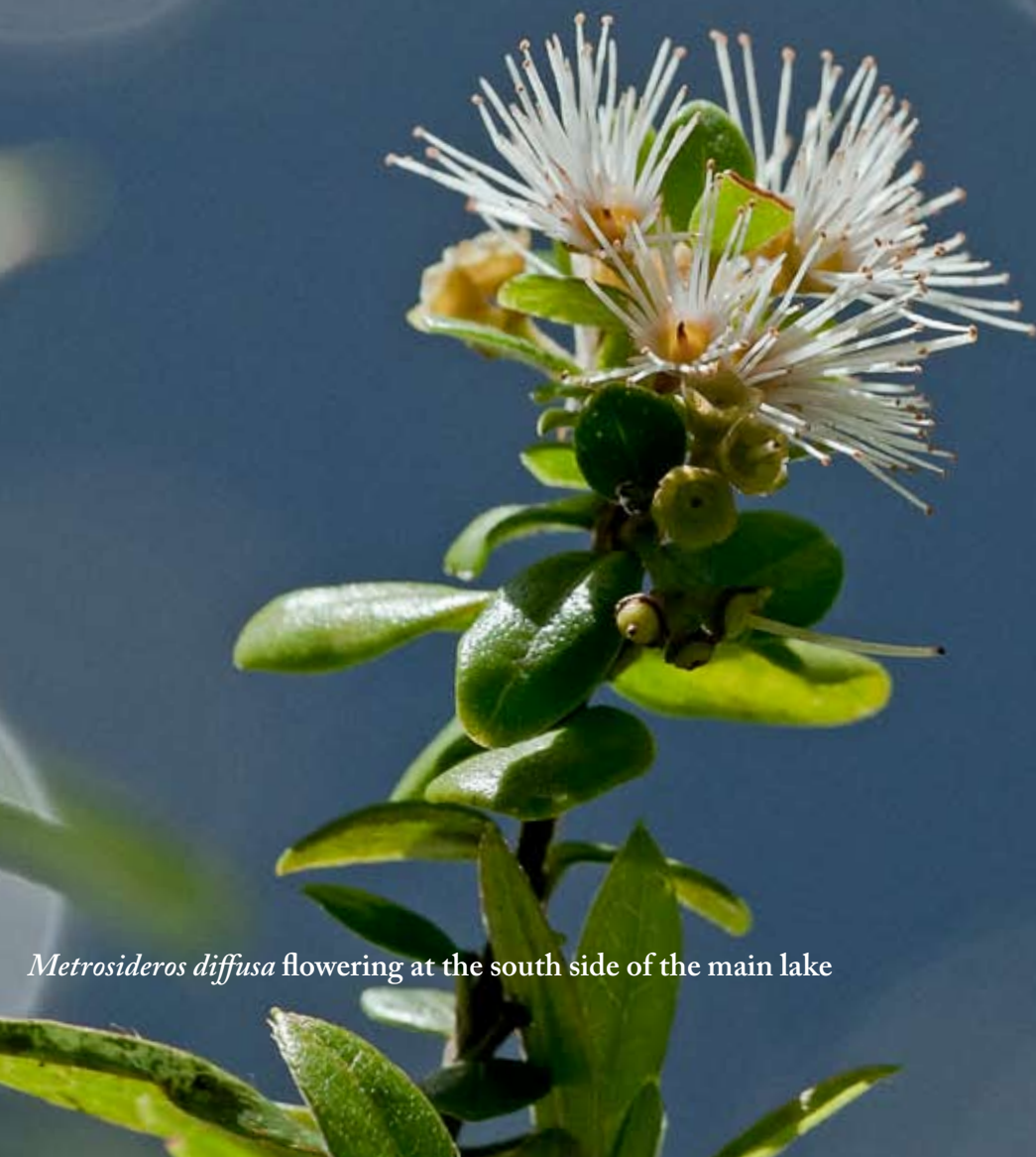
Metrosideros diffusa flowering at the south side of the main lake