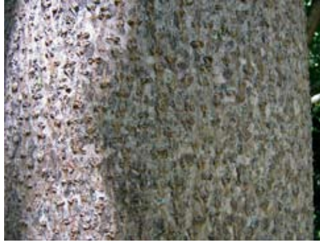
#2 Catalpa fargesii Fuller Walk