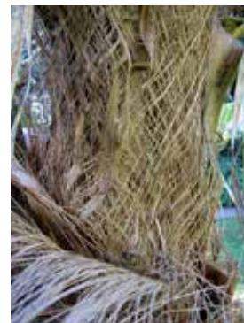
#10 Parajubaea sp. Palm Lawn