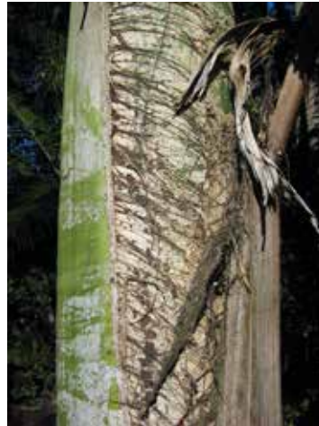
#5 Caryota sp. Palm Lawn