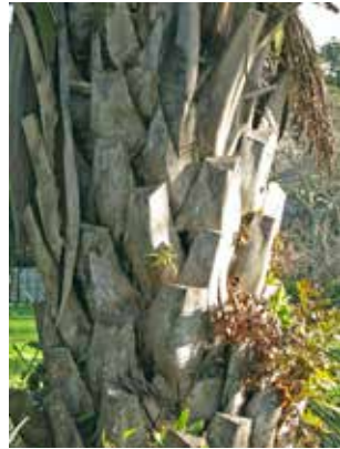
#11 & 12