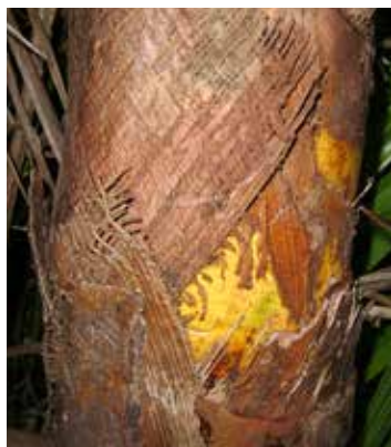
#13 & 14