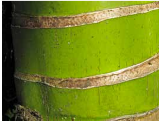
#2 New Zealand Nikau