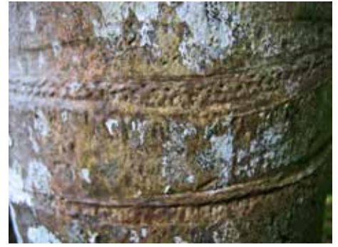
#3 Kermadec Nikau