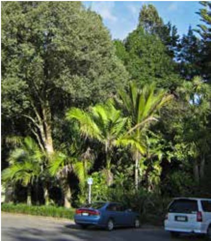
#1 Rhopalostylis baueri Next to Bellringer Pavilion