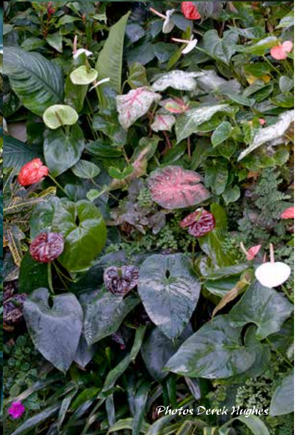
In the Fernery this month. A visual treat any time of year.