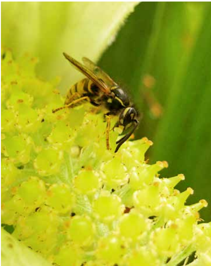
Common Wasps feeding at female Collospermum hastatum flowers.