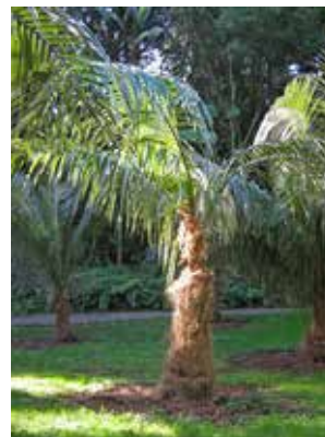
#9 Parajubaea sp. Palm Lawn