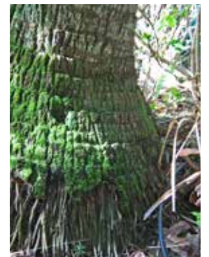
#7 Livistona australis Palm Lawn