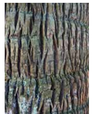
#8 Livistona australis Palm Lawn