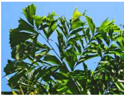
#4 Caryota sp. Palm Lawn