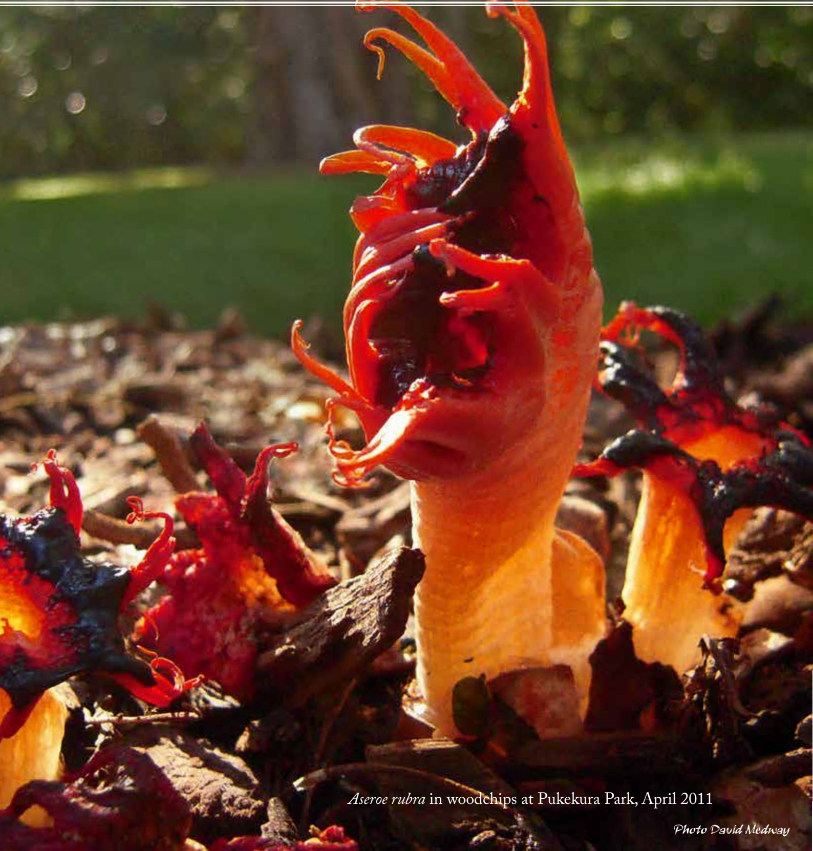
Aseroe rubra in woodchips at Pukekura Park, April 2011